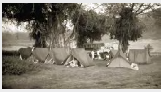
A group of guests camping on the Ngorongoro Crater floor in the 1980s; to preserve its cultural integrity and protect its fragile ecosystem, camping on the crater floor is no longer permitted.