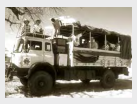
Bedford trucks like this one were used on "self-contained" safaris to transport every item, from food, to water, to tents, and guests!